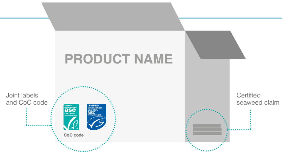
On wide labels - landscape label placement

Smaller packaging - if you are having difficulty incorporating our labels as specified in the guide please get in touch with the Licensing team via ecolabel@msc.org .